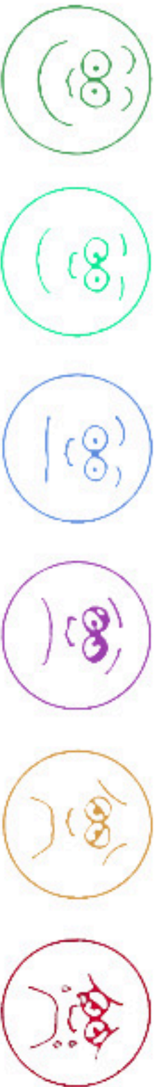
Facial Grimace Scale