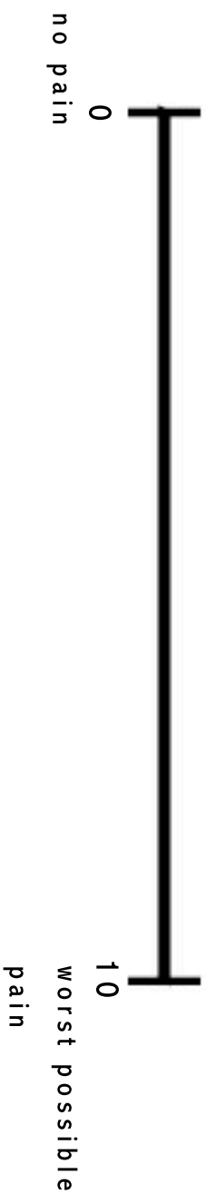
Visual Analog Scale